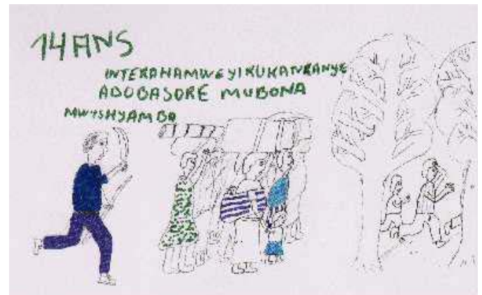
“Militiamen Chasing Refugees”

“I am traumatized by the memories of the day they cut off my arm and leg.”